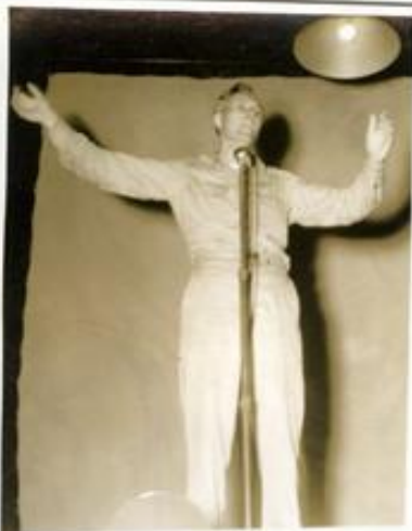
right 307th Bomb Group (HV) Association—www.307bg.org. All rights reserved

Hello, and Happy 2018 to all our Friends and Family Members!