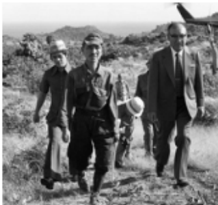
An Imperial Japanese Army intelligence officer, who fought in World War II,

Hiroo Onoda never surrendered in 1945. Until 1974, for almost 30 years, he held his position in the Philippines. His former commander traveled from Japan to personally issue orders relieving him from duty in 1974.