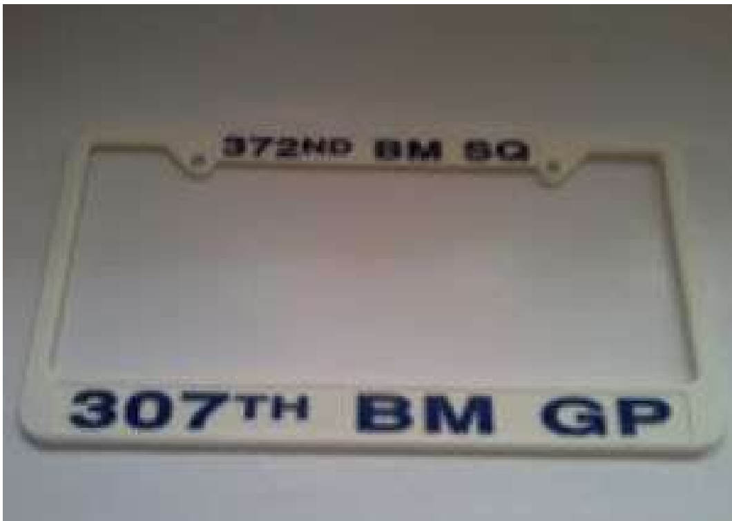
372nd Bomb Squadron License Plate Frame - Set of two - $15.95 $12.95