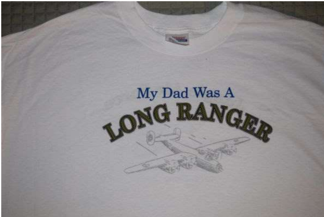
Official "My Dad was a Long Ranger" T-Shirt - $35.95 $30.00