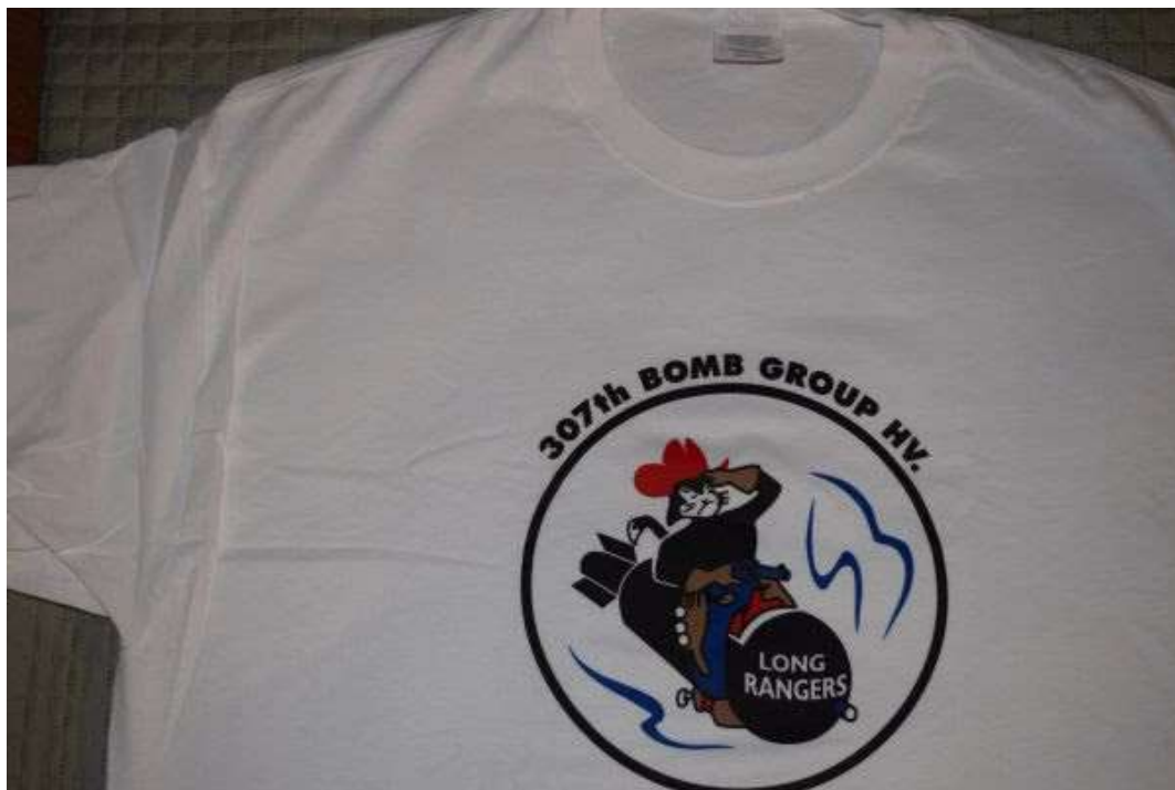
Official 307th Long Rangers T-Shirt - $24.95 $18.95

You can get to the reunion registration form here .