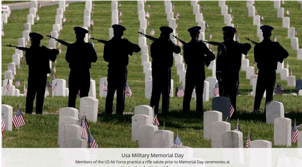
Usa Military Memorial Day Members of the US Air Force practice a rifle salute prior to Memorial Day ceremonies at the Los Angeles National Cemetery.